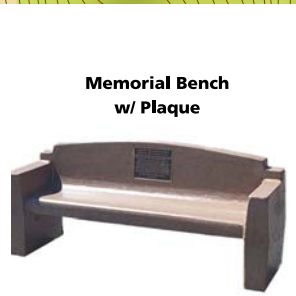
Memorial Bench w/ Plaque

Mount Konocti is a dormant volcano, part of the Pacific Ring of Fire, and dating back to the Pliocene era nearly five million years ago. Geologists believe that Mount Konocti first erupted 350,000 years ago, and as recently as 10,000 years ago. Geothermal activity still abounds in the area.