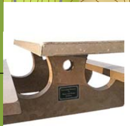
Memorial Picnic Table w/ Plaque